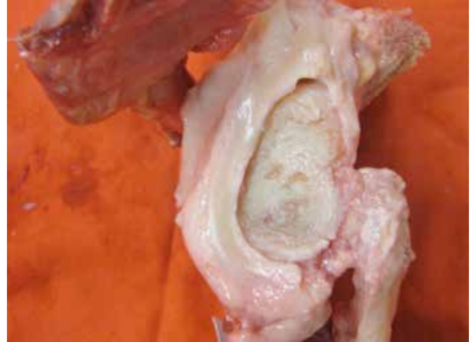
Figure 2. Image of anatomical piece after dissection. Case considered satisfactory.

Cases with the following characteristics were considered satisfactory: absence of neurological lesions, absence of tendon lesions, appropriate graft height, appropriate tilt of the screws in the axillary view (<15°), absence of diastasis and absence of articular deviation of the graft. (Figure 2)