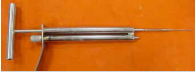
Figure 1. Guide used for transfer and fixation of the coracoid graft on the glenoid.

The specimens used presented all the muscles around the shoulder girdle, the whole scapula, the clavicle, the acromioclavicular and glenohumeral joints and the humeral diaphysis. They were placed in “beach chair” position, using a support device. The average age of the donors was 56.6 years (47 to 71 years). The average height was 180 cm (170 to 180 cm), with an average weight of 71.2 kg (60 to 100 kg), and all the cadavers were male. The procedure was carried out in accordance with the technique described by Lafosse et al. 5 It consists of five main stages: (a) exposure and preparation of the coracoid, (b) division of the subscapularis, (c) osteotomy on the coracoid; (d) transfer of the coracoid with the fixation guide, and (e) fixation of the coracoid.