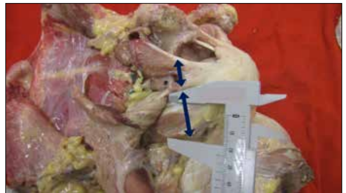
Figure 4. Divulsion of the subscapularis tendon and measurement of the thickness of the upper and lower portions of the tendon.

cases (41.7%). The average distance was 2.7mm (2 to 3 mm). In five cases (41.7%) the screws surpassed the posterior glenoid wall, with an average distance of 7 mm (variation: 0 to 21 mm) from the suprascapular nerve. In one case, the upper screw came into contact with the nerve, and in another the nerve was stretched (16.7%). (Figure 6)