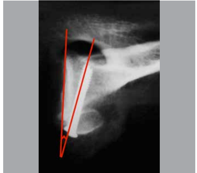
Figure 3. Radiography in axillary lateral view: evaluation of the tilt of the screws in relation to the glenoid axis.

Soft tissue interposition between the coracoid and the glenoid (labrum or capsule) was observed in three cases (25%). Diastasis between the graft and the anterior glenoid wall occurred in five