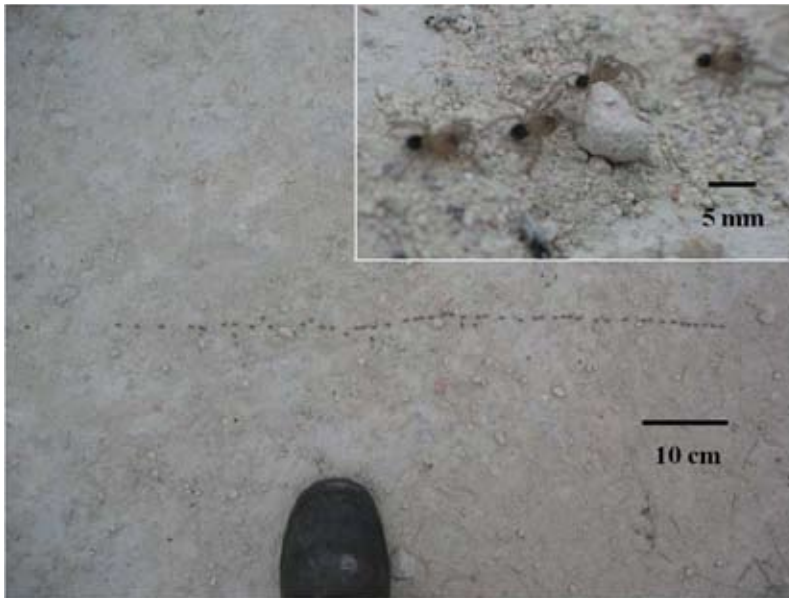
Figure 1. A column of about 200 B. vagans spiderlings observed on the road by the football field in Once de Mayo village, State of Campeche, Mexico. May 2nd 2005.

Spiderling development. The spiderlings of the two egg sacs hatched at different dates (Table 1), around 200 spiderlings hatched from both egg sacs 1 and 2. For egg sac 1, we observed abundant exuvia in the silk net on May 14 th , indicating the occurrence of the spiderlings' first molt. For egg sac 2, the first molt occurred on hatching, since on the morning of hatching; the open egg sac had a heap of exuviae at the entrance. The spiderlings' body length was 2-3 mm; they were then cream colored. The second molt occurred when the spiderlings were about 4-5 mm in body length and changed