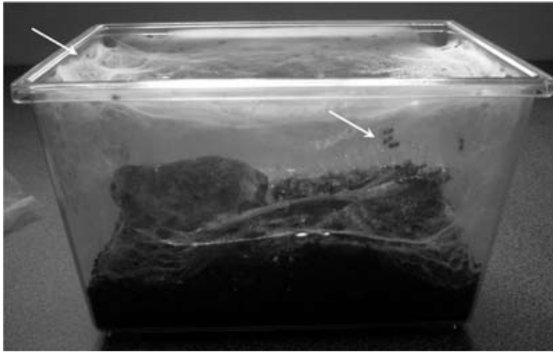
Figure 4. Silk produced by the spiderlings of egg sac 2. The upper arrow indicates the silk net, and the lower arrow a group of three spiderlings. The plastic box measures 20 x 13 at the base and 13 cm in height. May 29 th 2007 (12 days after hatching).

Behavior. Siblings from the second egg sac showed apparently pacific behavior towards each other during the two months of observation (until July 20 th ). Spiderlings occupied the soil or the walls of the box in groups of 3-8 (Fig. 4) or alone. Observation of groups in superficial small burrows was not possible. It was notable however, that the number of living spiderlings fell to 50 individuals, and that they increased in size from 4-5 mm after the second molt to 5-10 mm at the end of the observation. Increased sizes were due to permanent enlargement of the abdomen.