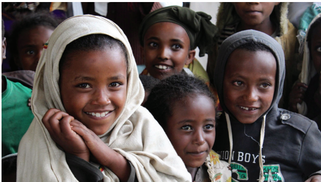
Photo: Children at a vaccinations clinic near Sululta, Ethiopia.

Although access to health care has been expanded, significant geographic disparities persist in regards to health care