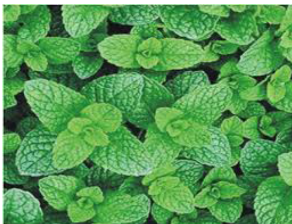
Figure 1. Fresh mint leaves.

The various chemical constituents of mint have a lot of economic importance. For example, various derivatives and constituents of mint oil have been used as an agent of flavor in the flavoring industry and in many types of foods, herbal products, medicine, and different perfumes. Mint oil is both water and alcohol soluble. The oil contains liquid and solid fractions, as they have hydrocarbon, which stops the crystallization of menthol. Research