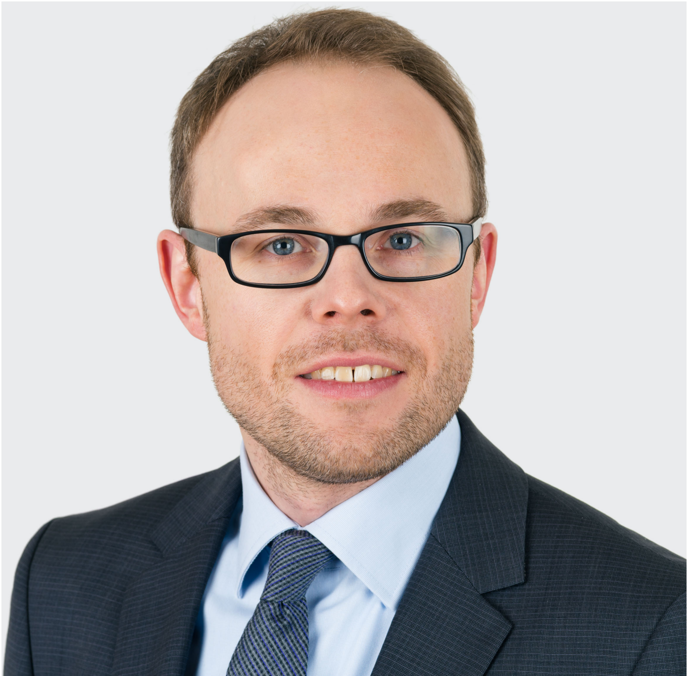
Fig 1. Christoph Bock.

https://doi.org/10.1371/journal.pcbi.1005559.g002