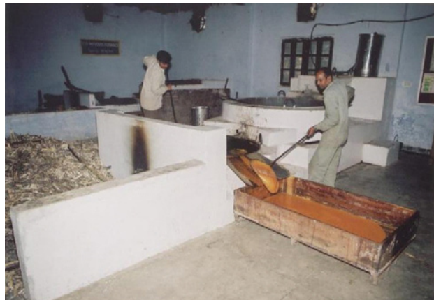
Figure 1: Triple pan furnace in operation.

It is an intermediate product obtained during concentration of purified sugarcane juice during jaggery making, and is semi liquid syrup like product. The quality of liquid jaggery largely depends upon quality and composition of cane juice, type of clarificants used, and striking temperature at which concentrating juice is collected. For quality liquid jaggery, the juice concentrate is removed from boiling pan, when it reaches striking point temperature of 103-106°C, depending upon the