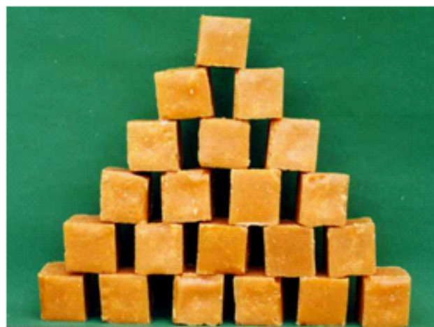
Figure 3: Cubical jaggery.