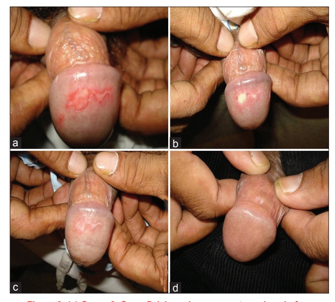
Figure 3: (a) Group 3: Superficial erosions present on glans before treatment with topical 4% zinc sulfate, (b) Group 3: Same patient at 5 days of follow-up periods after treatment with topical 4% zinc sulfate showing partial resolution of lesions, (c) Group 3: Same patient after 10 days of treatment with topical 4% zinc sulfate, showing almost complete resolution of lesions, (d) Group 3: Same patient after treatment with topical 4% zinc sulfate at 6 months follow-up period without any recurrences