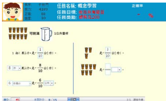
Figure 3(a). An example of a conceptual understanding activity

The learning tasks that were implemented in My-Pet-My-Quest are according to the criteria of the national curriculum for third-grade elementary school mathematics. Each unit contains three types of learning tasks: conceptual understanding , computational fluency , and problem solving . Conceptual understanding and problem solving are presented in the form of page-turners. Students are presented examples and guidelines and are asked to respond. Figure 3(a) depicts a conceptual understanding task from the unit titled Fractions . In this example, students fill in the answers according to the number of cups in the illustration. Similarly, Figure 3(b) presents an example of problem solving from the unit titled Multiplication , in which students are asked to solve a combination word problem that requires both multiplication and addition operations.