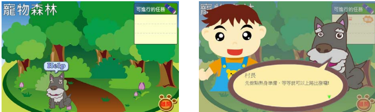
Figure 5. Quest NPCs providing information about quests