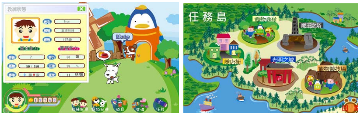
Figure 2. Pet status is shown on the left, while quest locales are shown on the right

As depicted in Figure 2, the My-Pet-My-Quest system is developed, in which each student controls a master avatar who keeps a pet, My-Pet; thus, a major goal is to maintain the status of the pet. Each My-Pet has attributes, such as energy and mood , which are reflected in its status and can be improved through feeding and playing with My-Pet, respectively. In other words, when the student feeds the My-Pet, the "energy" attribute would be increased. Likewise, when the student plays with the My-Pet, the "mood" attribute would be increased as well. A student is therefore able to monitor achievement through the state of their pet, both in terms of happiness and healthiness.