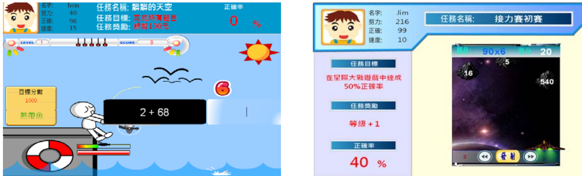
Figure 4. Learning tasks for calculation fluency via mini-games

Tasks for computational fluency take the form of mini-games and are used to consolidate students' computation skills in terms of both speed and accuracy. Figure 4 illustrates two mini-games. The mini-game on the left involves the addition of two three-digit numbers, while the mini-game on the right involves the multiplication of a two-digit number multiplied by a one-digit number. Solving these types of problems has been demonstrated to be beneficial for mathematics learning (Kilpatrick & Swafford, 2002).