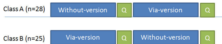
Figure 6. Experimental setting: Two within-subject groups

Since this experiment is a within-subjects design, all students were organized to experience the two system versions. To reduce the bias of treatment order, the within-subject groups were presented the two versions in a different order, as shown in Figure 6. More specifically, in Class A, participants first used the without-version for two sessions and then used the via-version for two sessions. In contrast, in Class B, participants first used the via-version for two sessions and then used the without-version for two sessions. Each session lasted 40 minutes and was held once a week. The procedures employed were as follows: (1) Before the experiment, participants were instructed to use the systems to ensure they know how to use. (2) during the these sessions, the number of participants' attempted tasks were also recorded in the system logs as a supporting evidence for goal-pursuing questionnaire. This is because the number of attempted tasks could be regarded as an indicator of students' goal-pursuing behavior. (3) At the end of each system version, the goal-pursuing questionnaire was administrated to collect students' perceptions.