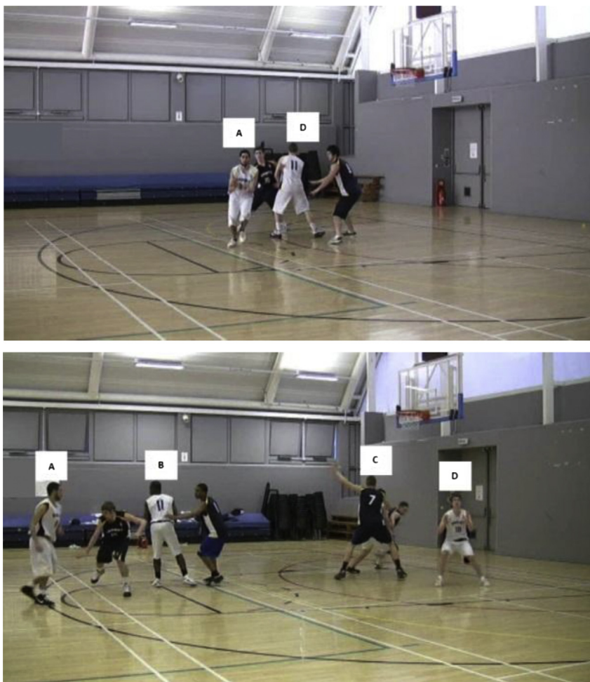
Fig. 1. Video stills depicting the design of the video stimuli used for the low-complex, two-choice response time (upper panel) and high-complex, four-choice response time (lower panel) tasks.

The task was designed and run on E-Prime (v. 2.0.1; Psychology Software Tools, Inc., Pittsburgh, Pennsylvania, US). Video sequences were presented on a computer screen viewed from a distance of approximately 0.5 m. Participants responded to each sequence by pressing one of two (low-complex trials) or four (high-complex trials) buttons positioned horizontally on a handheld response pad corresponding with players' on-court position (see Fig. 1).