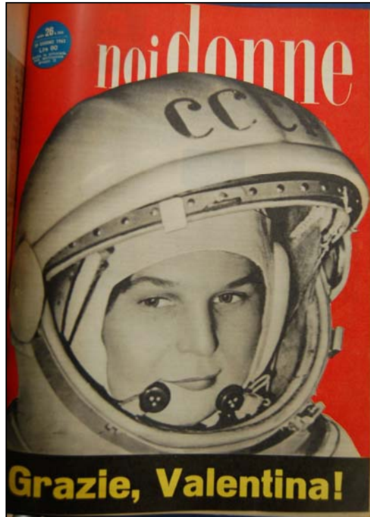
1963 cover of Noi Donne , thanking Valentina Tereshkova, the first woman cosmonaut

then opposed to local backwardness: “While the Sputnik, the artificial satellite, reaches the sky and represents the most beautiful and fantastic proof of technical progress and of man’s intelligence, it seems incredible and absurd that some bureaucrats keep imposing to women a useless exertion, sign of outdated times and customs”.