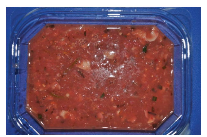
Fig. 1. Gastric contents shows semi-digested food material mixed with brownish fluid.

Nicotine has been one of the critical culprit chemicals for smokers. Because of its dependence and addiction smokers have to absorb about 1 mg per cigarette.31 But nicotine can also be one of the most toxic of all of the poisons with a rapid onset of