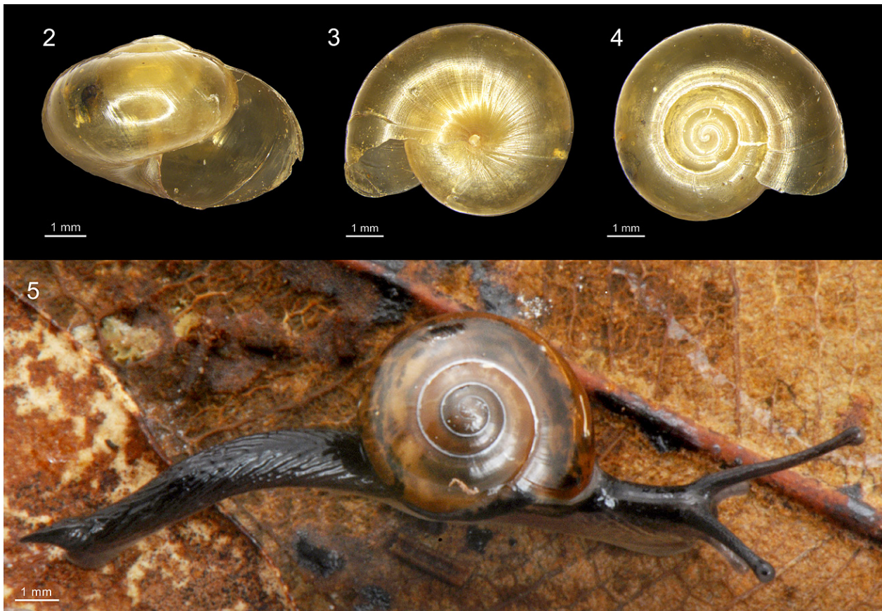
Figures 2–5. Specimens of Ovachlamys fulgens (MZSP 134512) found in Japu, Xixov-Japu State Park, municipality of So Vicente, So Paulo state, southeastern Brazil. 2–4 show an empty shell. 2. Aperture view. 3. Umbilical view. 4. Dorsal view. 5. A second individual, alive.

Capinera and White 2011). The species was also identified by its escape behavior (Teixeira 2017). However, until the reproductive anatomy and sequencing the barcoding COI are known, the species identification is only a tentative. The species identification was also corroborated as probably O. fulgens by Dr Zaidett Barrientos (Universidad Estatal a Distancia, Costa Rica), who reviewed our photographs of observed individuals.