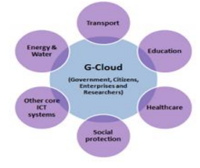
Fig. 1. Smart city G-Cloud platform [28].

City and metropolitan areas are abstruse social ecosystems, like local government, residents, and organizations [26]. The ICT is becoming progressively facilitating and enabling the ICTs to meet particular criteria relating to key themes, including enterprise and job growth, economic development, energy and water, public security, the atmosphere, health care, education, and public services. Simultaneously, urban spending is gradually being pressured by the new tumultuous global economic crisis, which is causing disastrous impacts not only on maintaining and upgrading existing ICT infrastructures and facilities but also on future innovation policies [27]. However, it has been identified, as an exemplary example of an answer to current and future complex challenges of the resource efficiencies, reducing emissions, sustainable health care services for older people, strengthening young people, and integral cities, which can be used for intelligent cities, information cities, digital towns, e-cities, and virtual towns. Smart cities, with their cameras, built-in computers, vast data