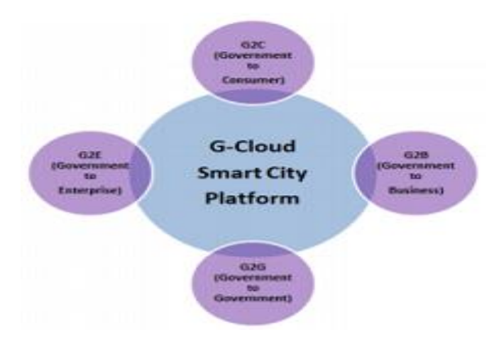
Fig. 2. Pilot smart city G-Cloud project [28].