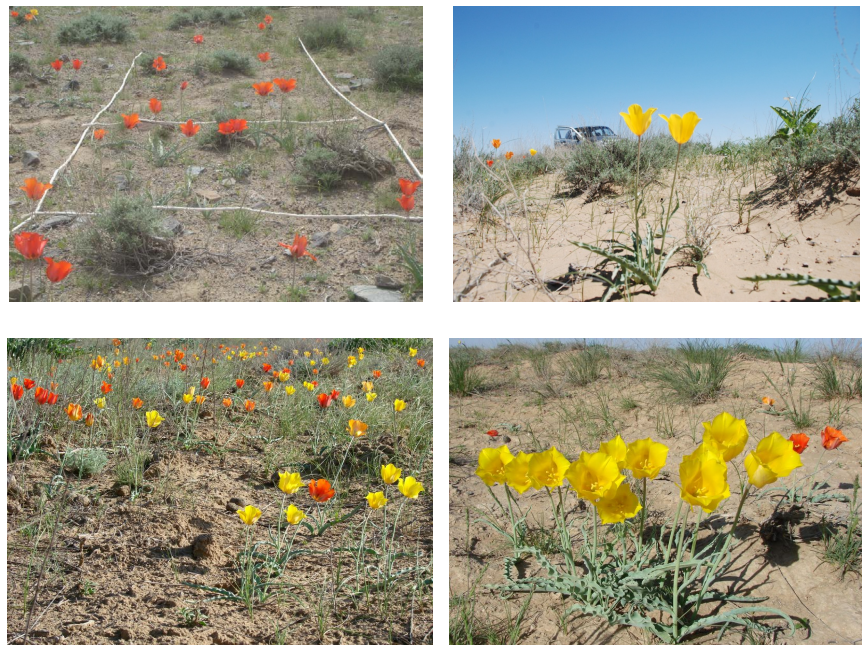
Figure 1. Cenopopulations of Tulipa lehmanniana in Kyzylkum desert (Uzbekistan).

All investigated coenopopulations were normal, but 5 and 7 coenopopulations were not complete. The maximum and high value of generative and senile individuals (4 - 5) marked in the CP 4. This is due to favorable environmental conditions of habitat. Young fraction was estimated 1 - 2 score. As noted above, the