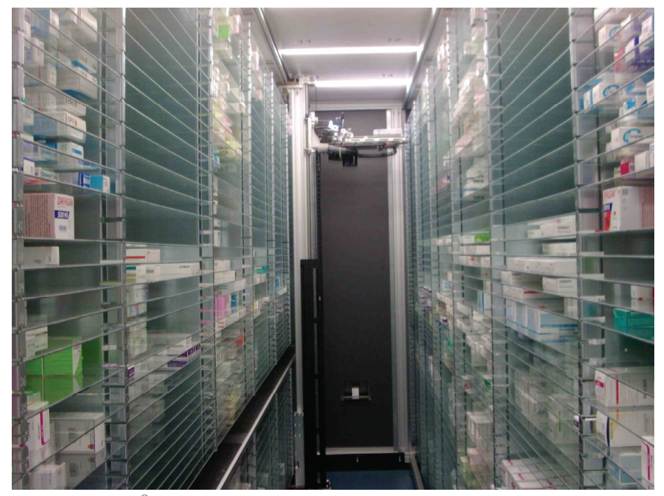
Fig. 1 Pharmacy-based ADS ARX<sup>®</sup> in 2013.