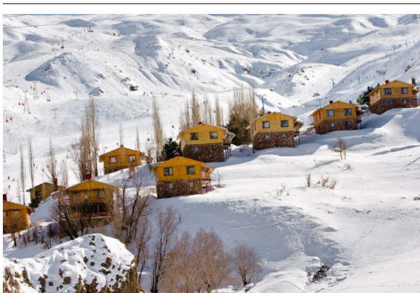
Figure 5. View of the Cabins at Dizin