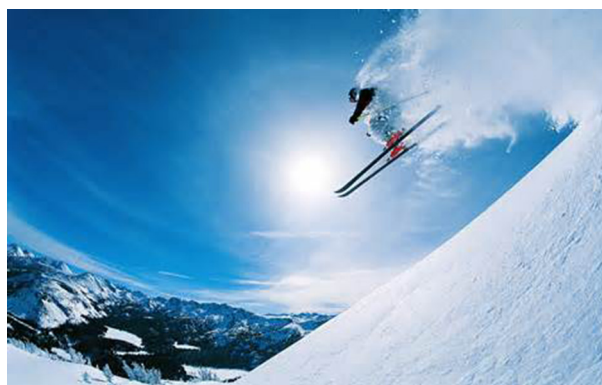
Figure 1. Powder Skiing

the novice. At present, the Dizin Ski Resort is governed by the Iran Ski Federation.