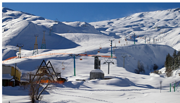
Figure 2. View of the Main Ski Piste