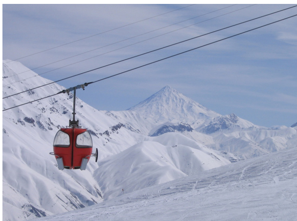
Figure 4. View of the Damavand Volcano From Dizin