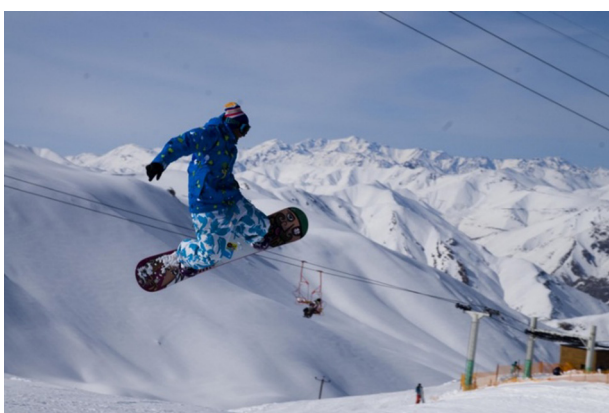
Figure 6. Snowboarding at Dizin