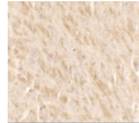
Immunohistochemistry of TLX2 in rat brain tissue with TLX2 antibody at 2.5 ug/ml.