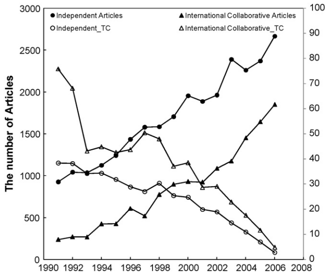
Fig. 2. Comparison the growth trends of international collaborative and independent PD articles in the world in number and Times Cited during the last 16 years.

participated in more than 90% of all world PD articles from ISI database, while thirty countries (25%) published only one article. Domination and imbalance in publication from mainstream countries was not surprising since this pattern occurred in most scientific fields [4].