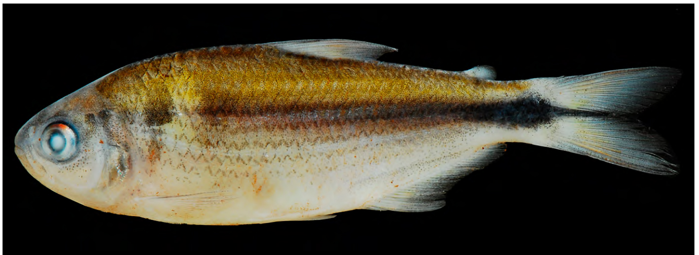
Figure 2. Astyanax lineatus (LS: 59.98 mm / CPUEMS 439) sampled in Lajeado Stream, a tributary of the Anhanduí River which is a sub-basin of the Pardo River in the upper Paraná River basin, Mato Grosso do Sul, Brazil.

The river basins of South America, including the upper Paraná, are the result of tectonic movements. More recent tectonic activities, from the Paleogene to the present, promoted rearrangements that are the main causes of headwa-