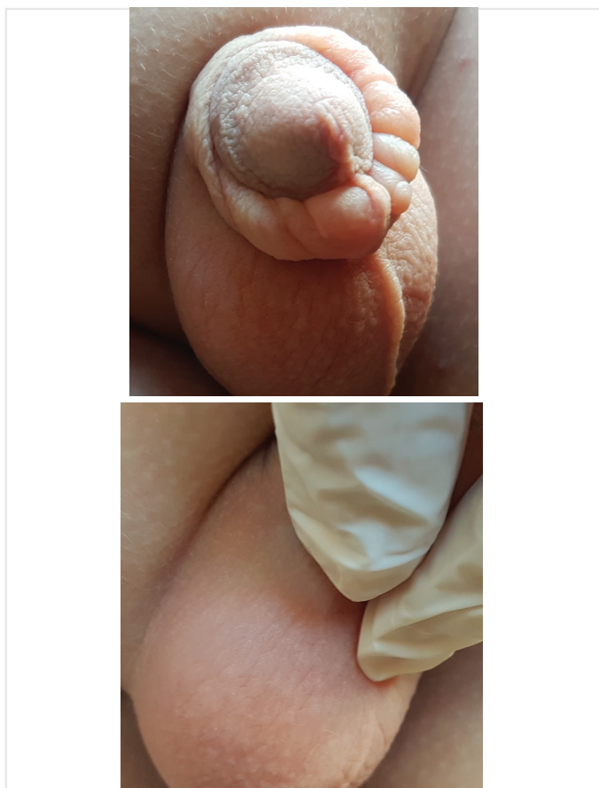
Figure 3a, b. Edema of the skin on the penis and redness in the scrotum seen during an attack of the first case

An 11-year-old girl had recurrent abdominal pain, swelling in the face and eyes for 7-8 years. Since the age of 3-4 years, she had abdominal pain that lasted two days every 2-3 months. While teething in the 1 st and 3 rd grades of primary education, she had swelling on the face. Her most