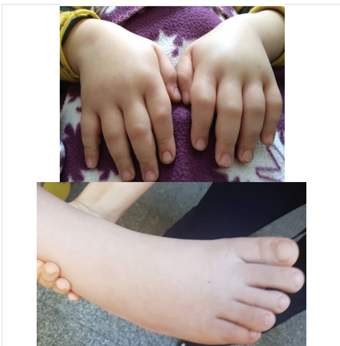
Figure 1a, b. Edema in the hands and feet seen in the attack period of the first case