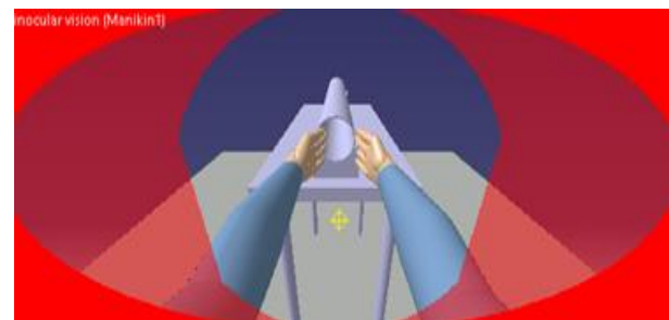
Fig 2: Binocular Vision of Manikin

Ergonomic risk factors associated with upper extremity MSD score for neck trunk and leg is 5 and their RULA score is 5 based on Rapid Upper Limb Assessment (RULA) [9], it is concluded that the working posture is improper and needs to be modified. Employees are not able to maintain standard body postures and movement because of poor work place design. Hence, leading to fatigue like shoulder stress, back pain and neck pain reducing working efficiency.