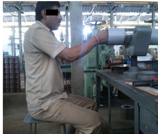
Fig 8: After implementation of height adjustable Fixture in their work place

force is less than that of the existing posture and concludes that revised posture is ergonomic posture.