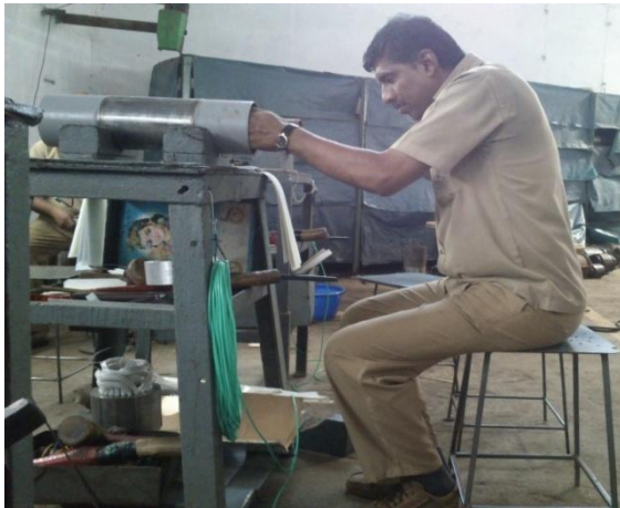
Fig 1: Existing Posture

component assembly inside the pump casing. Employees are Indian male working in stator assembly section and their anthropometry data are mentioned below.