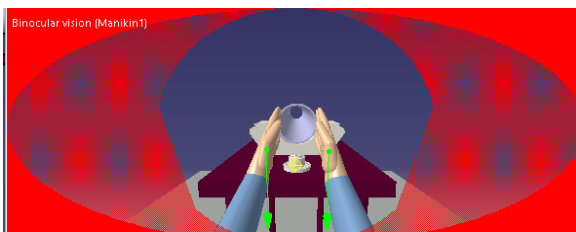
Fig 4: Binocular Vision of Manikin

Manikin is able to clearly see inside the pump casing with the help of height adjustable fixture as shown in Fig 4.