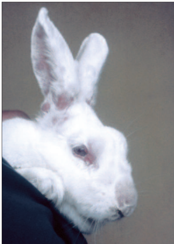
Figure 5 —Rabbit with myxomatosis; note the nodules (myxomas) on the face and ears.

some clinicians to be effective. Underlying bony involvement carries an extremely poor prognosis. Surgical debridement, removing affected teeth, and packing the abscess cavity with antibiotic-impregnated polymethylmethacrylate beads can be successful in many cases. 2,27 These beads need not be removed. We do not recommend the use of calcium hydroxide because it may cause severe tissue necrosis.