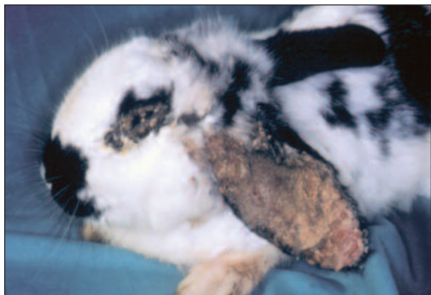
Figure 1 —Rabbit with P. cuniculi infestation; note extensive crusting of the pinna and periocular area.

Although it has been suggested that using mineral oil in the ear will resolve the infestation, one of the authors (S. D. W.) has seen these mites survive for 1 week in mineral oil under a coverslip on a microscope slide. Although removing ear crusts may lessen the mite burden, it is not necessary and may be painful to the rabbit. If the crusts are removed, they should be softened with mineral oil first; otherwise the lining of the ear canal can be damaged. With the advent of systemic treatment, such manipulation is seldom necessary. All mammals that have come into contact with the infected animal should be treated.