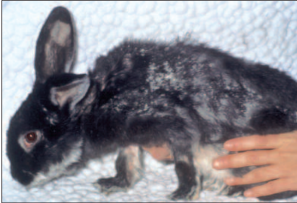
Figure 4 —Rabbit with sebaceous adenitis; note the generalized scaling and alopecia. (From White SD, Linder K, Shultheiss P, et al: Sebaceous adenitis in four domestic rabbits [ Oryctolagus cuniculus ]. Vet Dermatol 11:53–61, 2000; with permission of Blackwell Publishing)

T. mentagrophytes var quinckeanum . Microscopic examination of hair shafts may show infected hairs with a “rotting log” appearance. Definitive diagnosis is via fungal culture and is recommended because speciation may determine the origin of contamination. Recently, an indirect ELISA was developed and its diagnostic potential evaluated for rabbits infected by T. mentagrophytes ; this test may prove useful in earlier detection of the disease. 23