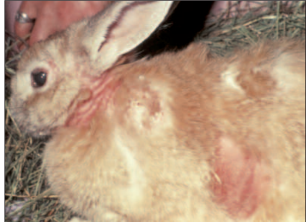
Figure 6 —Rabbit with cutaneous lymphoma; note alopecia and scaling of the neck and lateral trunk. (From White SD, Campbell T, Logan A, et al: Lymphoma with cutaneous involvement in three domestic rabbits ( Oryctolagus cuniculus ). Vet Dermatol 11:61–67, 2000; with permission of Blackwell Publishing)

Cutaneous lymphoma has been described in four domestic rabbits. 29,30 Three of the rabbits were young (7 weeks, 1 year, and 18 months) and were euthanized