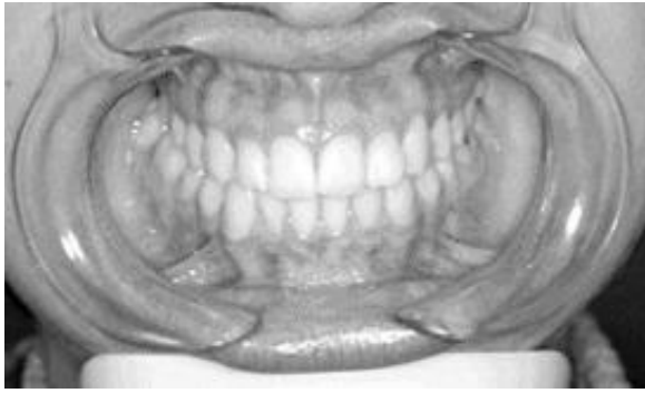
Fig. 1: The patient uses a plastic retractor before scanning

It also facilitates positioning of implant in different locations especially in immediate implant placement [1,5]. A thick tissue biotype plays a significant role in outcome of periodontal therapy [6,7] such as root coverage procedures [6,8,9]. Hence, measuring the thickness of soft tissue and the underlying bone before implant placement is beneficial to prevent complications such as soft tissue recession, implant exposure and consequent psychological problems [1,10]. When required, augmentation can be considered to achieve adequate contours [11].