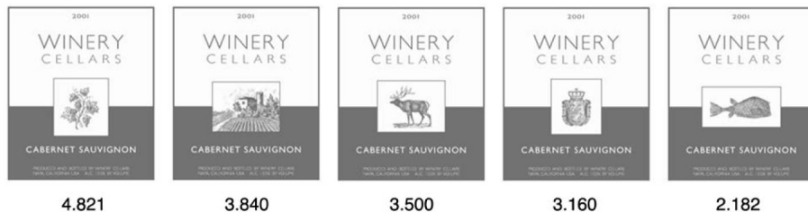
Figure 3. Mean purchase intent ratings for a sample of labels using different images: this set of images changed average purchase intent by more than a factor of two from least to most preferred

Each of the three layouts used has its own associations in the wine market. The traditional/unprinted layout is the oldest and most traditional design, and this is the type of design most typical of high-end and French wineries, though it can be found on wines of all origins and qualities. The full-color version of this label is somewhat more recent and common among American wines. The third layout, used to provide contrast