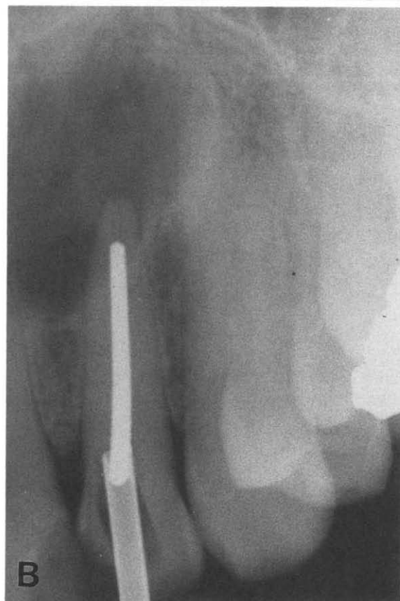
FIG 2. Clinical case demonstrating use of the silver point extractor. Based on the large size of the silver point in tooth 10 (A), a #80 extractor was chosen. Overlap of 1.5 to 2 mm was achieved (B).