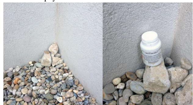
Fig. 3: Hidden and revealed Container

According to the Geocaching -Website, there are over 2,000,000 active geocaches and over 5 million geocachers worldwide [18]. The geocaching rules contain several different types of “caches”, such as Traditional Caches, Multi-Caches (also known as Offset Caches) and Mystery or Puzzle Caches. According to the official rules, a “cache” is “at minimum, a container and a log book or logsheet.” [20]. As far as a Traditional Cache is concerned, the coordinates listed on the traditional cache webpage (hosted by geocaching.com) provide the geocache’s exact location (this is where the container is hidden). A Multi-Cache (“multiple”) involves two or more locations, also referred to as “stages”. The final location is a physical container.