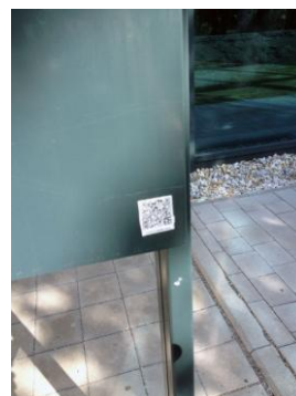
Fig.4: Hidden Munzee on the backside of a mailbox

Munzee uses QR-code style barcodes, called Munzees, which come in any size or shape. The barcode is a mandatory requirement for the game since it is linked to the GPS coordinates, which are the essential gameplay elements of Munzee. Compared to Caches, Munzees follow the same principles but instead of signing a logbook, players log their positive find by scanning the QR-Code with their smartphone using the Munzee App [21]. Since Munzees are plain QR-Codes, they can be hidden in containers, camouflaged or placed in plain view. Compared to geocaches they are easier to hide but lack the ability to contain anything (like a logbook or an object).