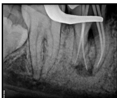
Fig.3 Master cone fit radiograph.