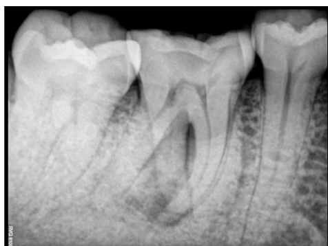
Fig.1 Preoperative radiograph of Radix with 46.

preparation, a closed dressing was given. On recall after a week, the patient was asymptomatic. The canals were irrigated with 1.2% chlorhexidine gluconate, warm saline and dried with paper points and obturation was done with corresponding protaper gutta-percha cones (Dentsply Maillefer) using Sealapex sealer (Dentsply, Maillefer). The access cavity was then sealed with light cure composite(3M ESPE) (fig3,fig4).