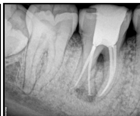
Fig.4 Post operative radiograph.