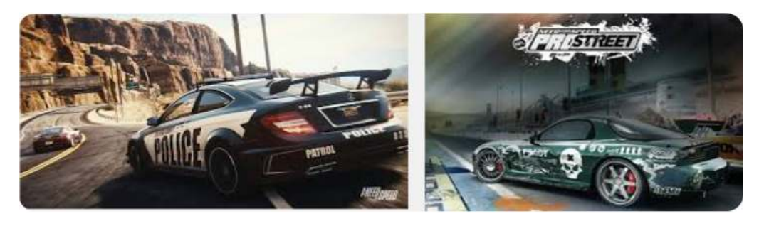
Fig. 1: Rich graphics supported by GPUs.