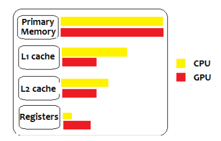
Fig. 6: Memory structure of CPU and GPU