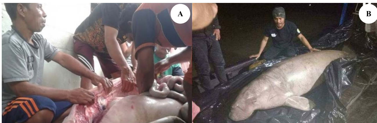
Figure 2. A. A dead adult dugong was being cut by fishermen to be sold in Penyak Village, Koba Sub-district, Central Bangka District on 5 January 2017; B. A live adult dugong was being rescued from Kurau Village, Koba Sub-district, Central Bangka District on 17 April 2017

The second action was the establishment of Semujur and Panjang Islands, Central Bangka District as dugong conservation and rehabilitation areas in early July 2017 by Indonesian Ministry for Marine Affairs and Fisheries. The establishment was a form of the awareness of Indonesian Ministry for Marine Affairs and Fisheries toward dugong conservation in Bangka Island (Maranda 2017).