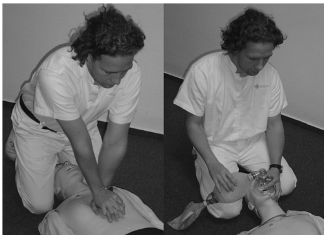
Figure 1 Over-the-head cardiopulmonary resuscitation (CPR) position for chest compressions and ventilation.

Study participants were informed about the general aim of the study but were blinded to the outcome and the stated hypothesis. Each participant performed 30 chest compressions and two breaths, alternately, with a bag–valve–mask for 2 min in the over-the-head, lateral and alternating positions alone, and in each dual-operator CPR position in a randomised order on the simulator (Resusci Anne Simulator, Laerdal Medical AS, Stavanger, Norway). The simulator was placed on the floor. Between the two different positions, participants had at least