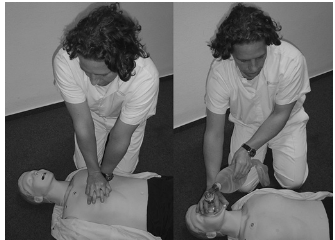
Figure 2 Lateral cardiopulmonary resuscitation (CPR) position for chest compressions and ventilation.

a 30-min break for recreation, to exclude diminished quality because of exhaustion.