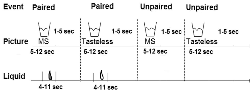
Figure 1. Example of timing and ordering of presentation of pictures and drinks during the run.

Five lines of evidence from an ongoing fMRI study in which this paradigm was used with adolescent girls ( N = 46 ) suggest that it is a valid measure of individual differences in anticipatory and consummatory food reward. First, participants rated the milkshake as significantly, t(45) = 9.79 , r = .68 , p < .0001 , more pleasant than the tasteless solution per a visual analogue scale, confirming that the milkshake was more rewarding to participants than the tasteless solution. Second, pleasantness ratings of the milkshake correlated with activation in the anterior insula ( r = .70 ) in response to milkshake cues and with activation in the parahippocampal gyrus in response to milkshake receipt ( r = .72 ). Third, activation in regions representing anticipatory and consummatory food reward (LaBar et al., 2001; O'Doherty et al., 2002; Small et al., 2001) in response to anticipation and receipt of milkshake in this fMRI paradigm correlated ( r = .84-.91 ) with self-reported liking and cravings for a variety of foods, as assessed with an adapted version of the Food Craving Inventory (White et al.,