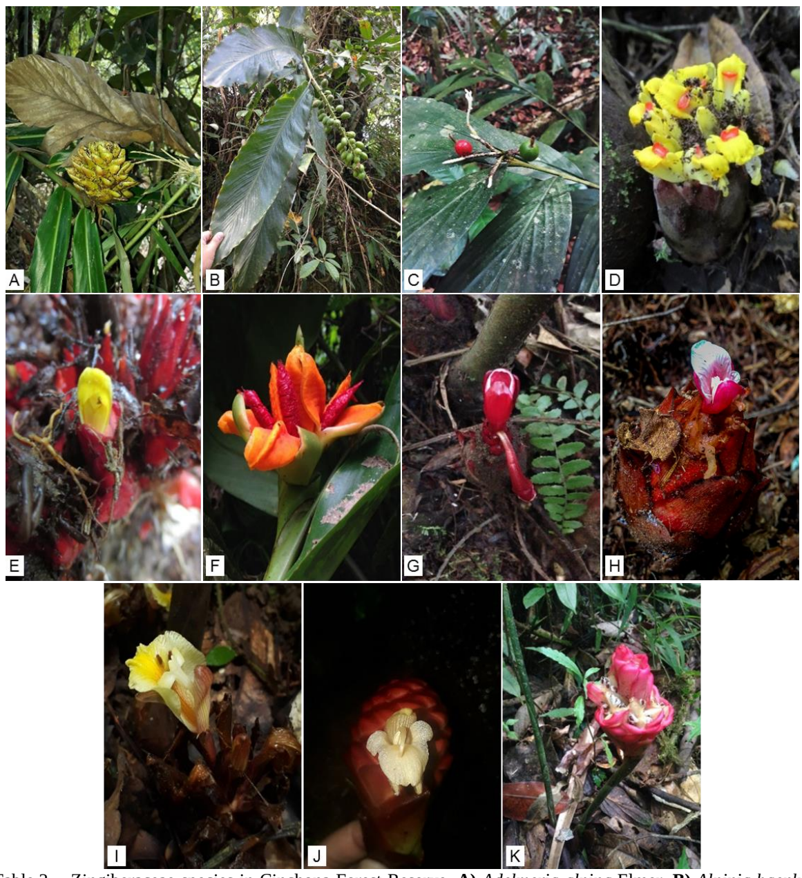
Table 2. Zingiberaceae species in Cinchona Forest Reserve. A) Adelmeria alpina Elmer, B) Alpinia haenkei C.Presl, C) Alpinia rufa C.Presl, D) Etlingera fimbriobracteata (K.Schum.) R.M.Sm., E) Etlingera pubimarginata (Elmer) A.D.Poulsen, F) Hedychium philippinense K.Schum., G) Hornstedtia conoidea Ridl., H) Hornstedtia lophophora Ridl., I) Meistera muricarpa (Elmer) Škorničk. & M.F.Newman, J) Zingiber banahaoense Mood & Theilade, and K) Zingiber sp.