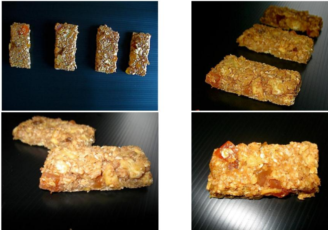
Figure A1. Breadfruit bar © 2014 Mark Wilkens.