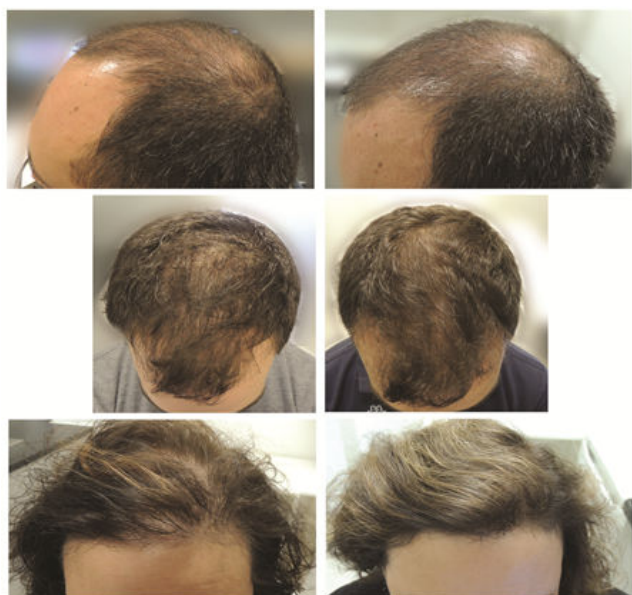
Figure 3: Global photographs of subjects 26 (above), 11 (middle), 29 (below) at Time zero (left) and after 6 month of treatment (right).

Global photograph review: Photographs review and analysis show an interesting improvement of hair density already at T 3 ; however, the major variances can be appreciated at T 6 . After 6 month treatment 83.3% of subjects experience an increased hair density (Table 4). Reference photographs are shown in Figure 3.