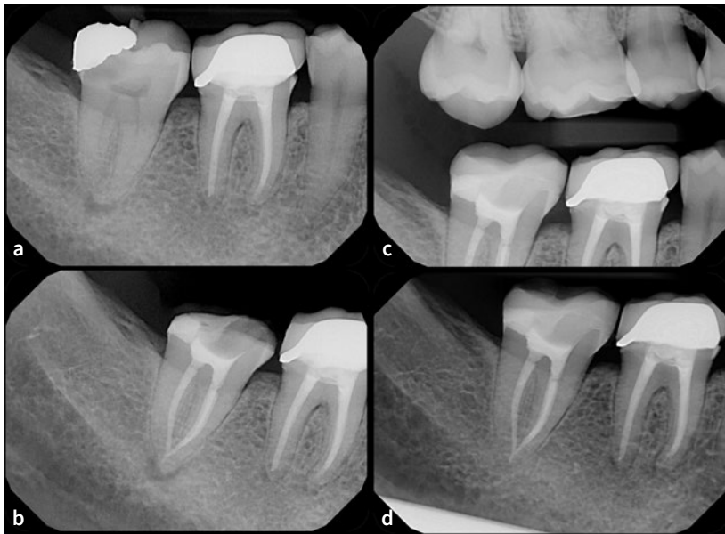
Fig 3 A periapical radiograph showing the mandibular right second molar with a defective disto-occlusal amalgam restoration, recurrent caries and a radiolucent apical lesion (a). A diagnosis of necrotic pulp with asymptomatic apical periodontitis was made. Root canal treatment and deep marginal elevation of the distal margin were performed (b). Following a follow-up period of 23 months, a bitewing (c) and periapical (d) radiographs show good adaptation of the DME material and the direct restoration, and the resolution of the apical pathology.

tissue component of the biological width. Our results showed an excellent short- to mid-term outcome for DME, with a success rate of more than 96%. The fact that 4 teeth with preoperative apical pathology showed good healing upon follow-up suggests the presence of a good coronal seal. Upon follow-up, one tooth was symptomatic with evidence of apical pathology and was considered a failure. While coronal microleakage could be implicated, the outcome of endodontic treatment is multifactorial, and it is difficult to ascertain the exact cause of failure. The emergence of apical pathology in this case cannot be directly attributed to the DME procedure itself, especially since no recurrent caries could be identified clinically or radiographically in that tooth. The case was considered a failure and the patient opted to have the tooth extracted.