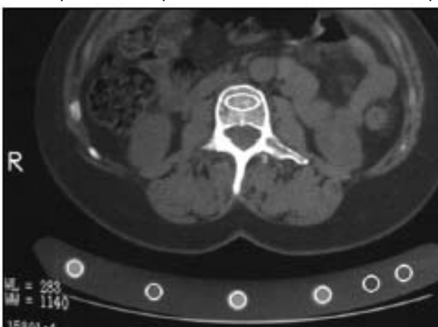
FIGURE 3. QCT axial view with region of interest placed in vertebral body and calibration device under patient.

QCT differs from DXA in that it provides separate estimates of the bone mineral density for trabecular and cortical bone. This is provided as a true volumetric mineral density in mg/cm 3 . The technique can be performed at axial sites and peripheral sites.