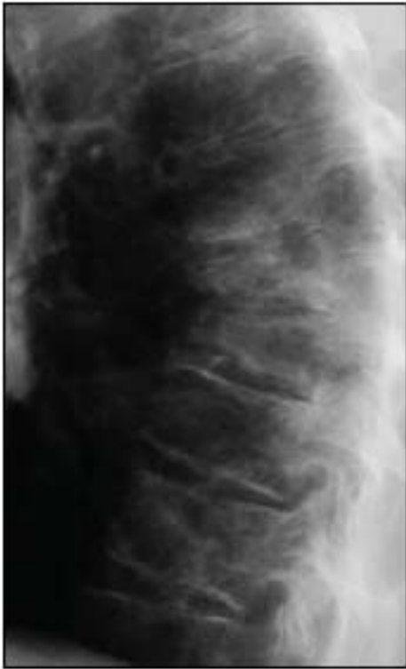
FIGURE 1. Lateral radiograph of dorsal spine shows severe osteoporosis with multiple fractures of vertebral endplates leading to biconcave deformities of vertebrae.

The main radiographic features of generalized osteoporosis are cortical thinning and increased radiolucency. 1 Vertebral fractures are a frequent complication of osteoporosis. Although osteopenia cannot be diagnosed reliably from plain-film x-ray images, spinal radiography can help considerably when diagnosing and following up vertebral fractures (Figure 1). Vertebral height measurements can also be made on plain-film x-rays, reducing subjectivity. Compression fractures can occur anywhere in the spine, although T4-L4 is the most common site. A vertebral fracture appears as an alteration in the shape and size of the vertebral body. A wedge is seen when the anterior vertebral body height is reduced in relation to posterior height. Reduced mid height in relation to posterior height is visualized as an endplate (mono- or biconcave), and when all heights of a vertebra are reduced in relation to the dimensions of adjacent vertebrae, this is seen as a crush, or collapse, vertebral deformity.