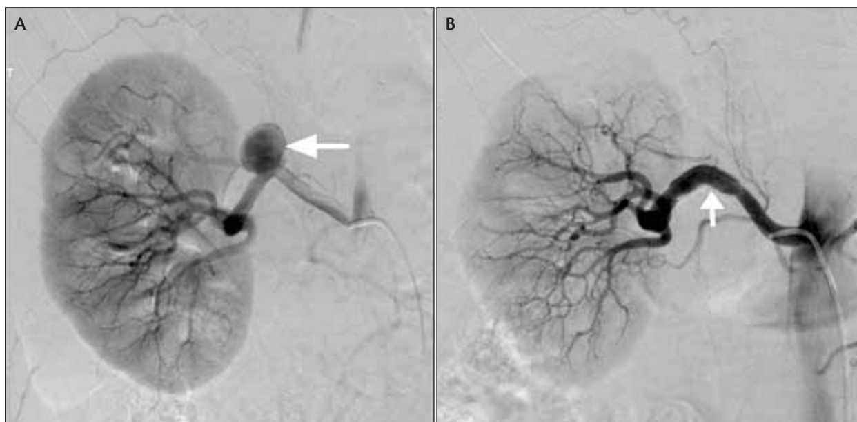
Figure 1. A 54-year-old woman with an enlarging right main artery aneurysm that was treated with a stent graft. A right renal angiogram shows a large aneurysm (arrow) arising from the main renal artery. A small segmental branch arises from the aneurysm (A). The aneurysm was successfully excluded with a stent graft (iCast, Atrium Medical Corporation, Hudson, NH) (arrow) (B).

RAAs are treated via an endovascular approach due to its minimal invasiveness and reduced morbidity.