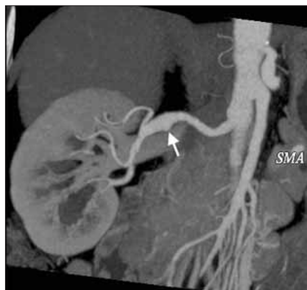
Figure 2. Oblique subvolume maximum-intensity projection of computed tomographic angiography data showing a fusiform aneurysm (arrow) of the right renal artery in a 55-year-old woman.

Because the renal arteries are end arteries, it is unlikely that the intraparenchymal aneurysms would reperfuse with embolization of the feeding arteries. This often results in infarction of distal renal parenchyma supplied by the feeding artery. Embolization of intraparenchymal