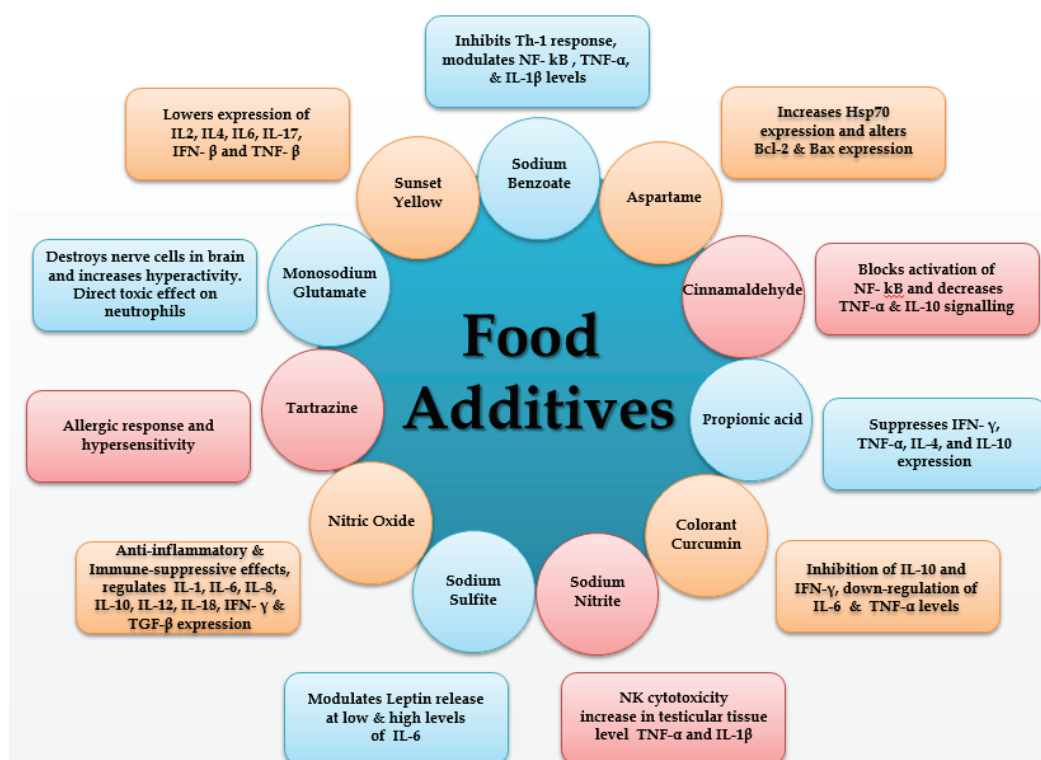
Figure 2: Immunomodulatory properties of Food Additives.