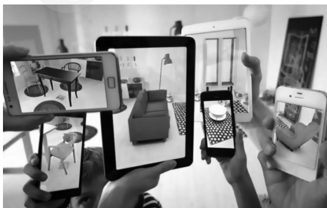
Figure 2. Augmented reality – IKEA

Other AR applications in marketing can be presented on the example of IKEA, where AR allows one to see the furnished interior through the AR overlay with pieces of furniture being accessible in IKEA shops (Figure 2).