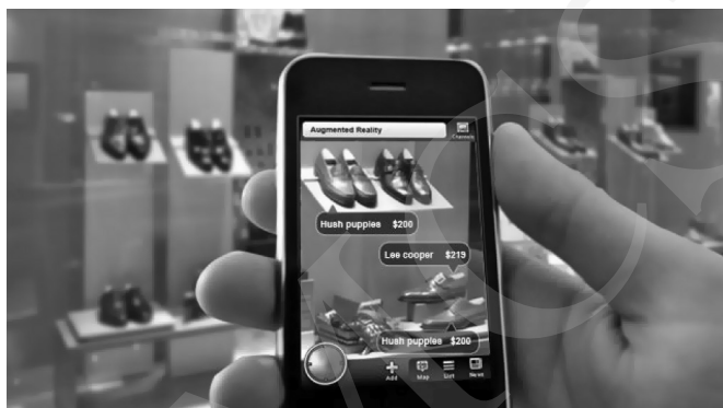
Figure 1. Augmented reality in the point of sale – a shoe shop

land, AR utilization for marketing purposes is still rare, but in the world it develops faster and faster. AR can also add variety to any kind of events, fairs, or business meetings, as well as occasional parties 3 . Figure 1 presents the possibility to use AR in the point of sale – a shoe shop.