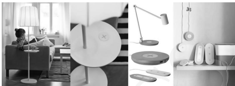
Figure 5. Internet of Things – IKEA