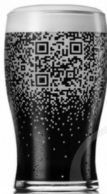
Figure 3. Creative utilization of QR code – Guinness brand