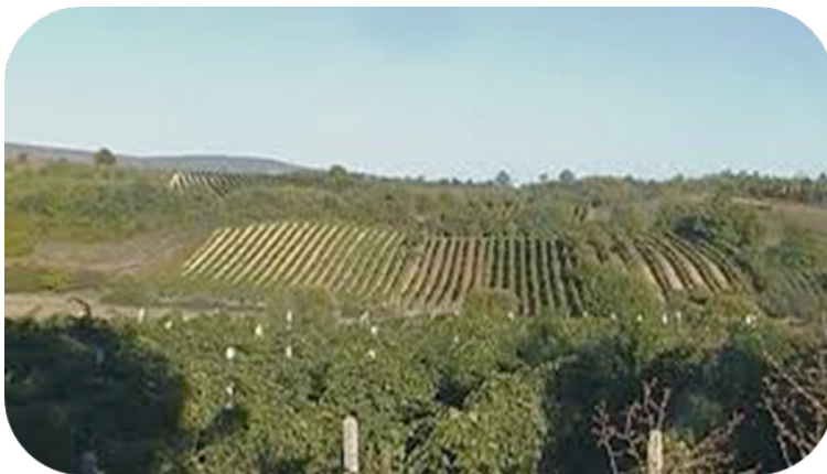
Figure 1: Panorama of the Orahovac vineyards.

Some of the most famous wineries on the ninth of the marked wine routes in Serbia are Vinica Petrović from Velika Hoča, as well as Antić winery from Orahovac. They make wine using Italian Riesling, the Rhein Riesling, Red Burgundy, Vranac, Sauvignon and Cabernet sorts (Serbia.com).