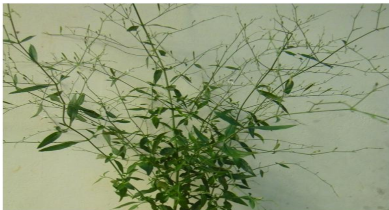
Fig 1: Aerial parts of Andrographis paniculata plant