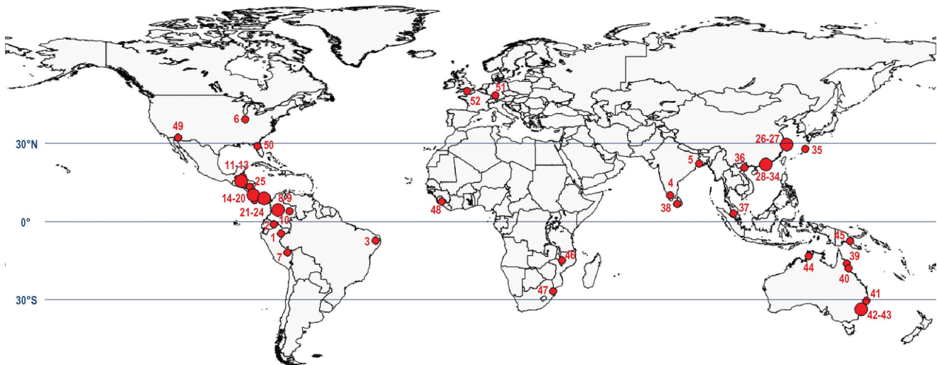
Figure 1. Geographic distribution of bat catching spiders worldwide. The map depicts the locations where spiders were observed catching bats (red dots). Large red dots indicate that several reports originated from the same geographic region. Numbers refer to the detailed report description (see File S1).