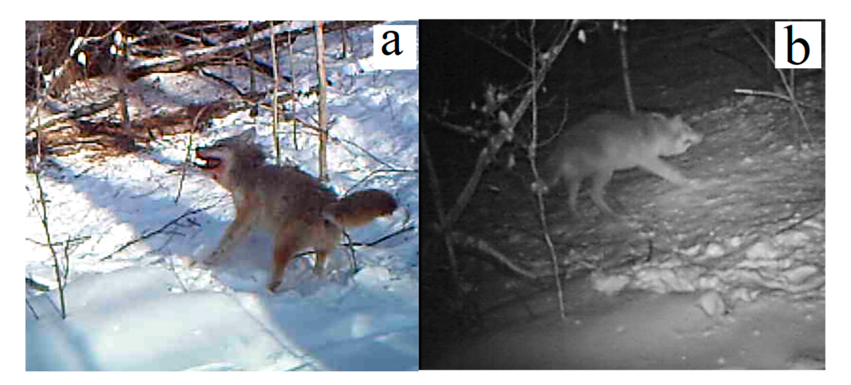
Figure 3. Trail cameras recorded the capture of a coyote in a killing neck snare on a working trapline [10]. The animal was alive for 14 h and 16 min: (a) the animal tried to escape at capture time; (b) 11 h 30 min later, the coyote was still fighting to escape.

captured in various killing neck snare models were still alive when found [28]. While it is best to snare canids behind the jaw where the carotid artery and the trachea are maximally exposed [26], snare location on an animal is influenced by many factors such as the behaviour of the animal when entering the loop [8], snare height and loop diameter, positioning of the lock, preload on the loop (i.e., a little tension is put into the loop to force it to close quicker), and environmental and maintenance factors (rust, twists in the snare cable, snowfall), etc. [26]. Not surprisingly, the percentage of animals found alive in killing neck snares is relatively high [10]. Canids kept alive in killing neck snares die hours or days after being captured, with injuries akin to those recorded with steel-jawed leghold traps [30].