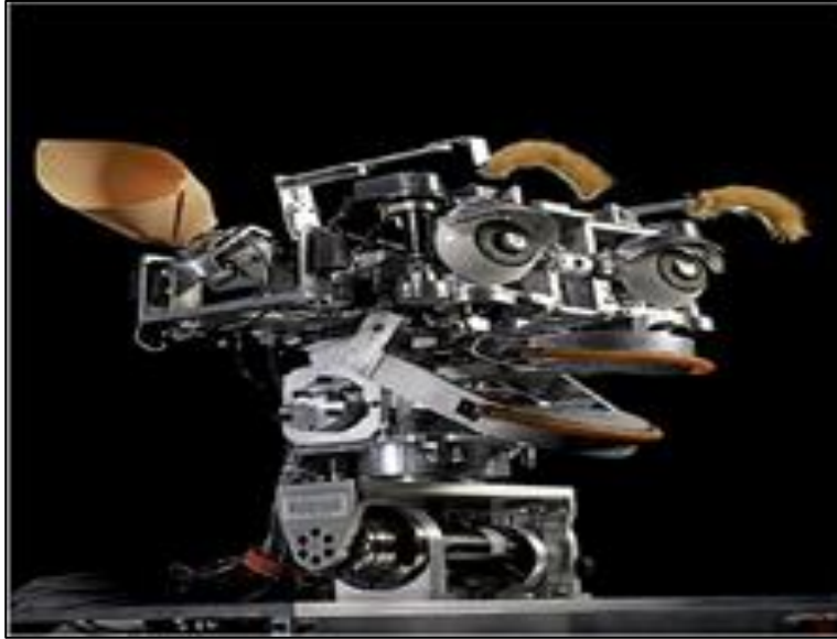
Fig. 3: Kismet, a robot with rudimentary social skills Emotion and social skills play two roles for an intelligent agent

First, it must be able to predict the actions of others, by understanding their motives and emotional states. (This involves elements of game theory, decision theory, as well as the ability to model human emotions and the perceptual skills to detect emotions.) Also, for good human-computer interaction, an intelligent machine also needs to display emotions. At the very least it must appear polite and sensitive to the humans it interacts with. At best, it should have normal emotions itself.