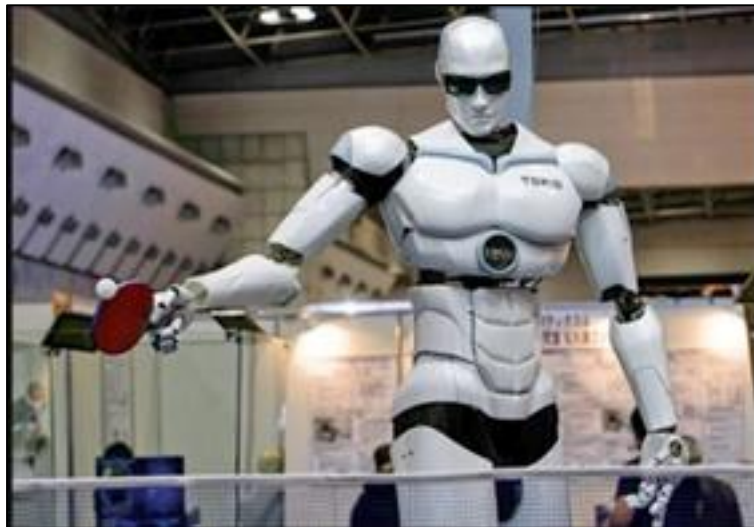
Fig. 4: TOPIO, a robot that can play table tennis, developed by TOSY

A sub-field of AI addresses creativity both theoretically (from a philosophical and psychological perspective) and practically (via specific implementations of systems that generate outputs that can be considered creative). A related area of computational research is Artificial Intuition and Artificial Imagination.