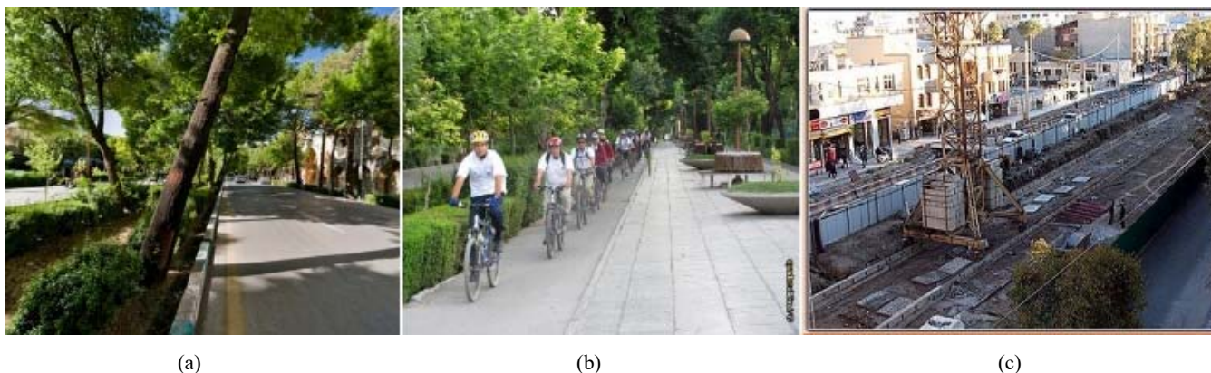
Fig. 7 (a) Vehicle path (b) Bike and pedestrian path (c) Subway construction, [30]

Chaharbagh Street has been known as a multifunctional street specially used as shopping and entertainment space. Multifunction of street has made this it live street in 24 hours of 7 days. Also existence of historical and monumental buildings in this street present the space as an identifiable street which is memorable for users even the once visiting. Façade of the street made by this building has unity along the street, even they were for a different historical period. The height level of the buildings is average between 1 to 3 stories