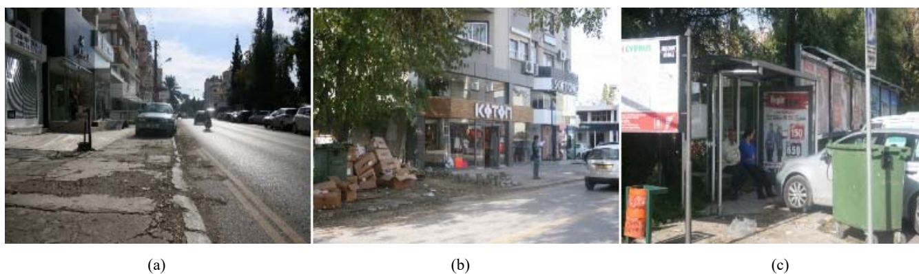
Fig. 4 (a) Pedestrian quality (b) cleanliness of the street (c) street furniture and bus stop location, cars blocked pedestrian path

The functions of street include; shops, restaurant, offices, residential, hotels and other facilities. Organization of functions is random through the street, and relationships between the residential parts and other functions are weak. The street is not serving the daily needs of the nearby residents; due to this fact, local people who can access the street by walk do not use the street efficiently. Despite this weakness, the street seems to be attractive for the public in terms of 'brand shops', 'restaurants', 'cafes', 'banks', and 'offices'. The facade of the street is covered by different types of buildings in different height levels between 1 and 6 stories. There is no unity among them in terms of facade, height, material, etc. (Fig. 3 (a))