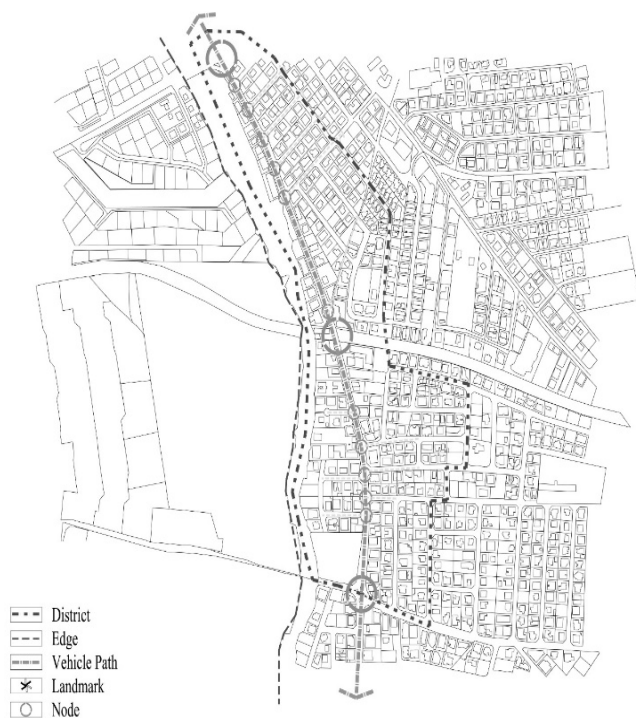
Fig. 2 Lynch Analysis of Dereboyu Street, Lefkosa/North Cyprus

The next level of man-made environment evaluation is the Lynch analysis that is initially used to define the image of the Dereboyu Street. According to Fig. 2, there is a strong vehicle path. The street is facing with car traffic during rush hours. There is not a positive pedestrian connection between the street and other parts of the city; those who are walking are coming with their cars, and lack of car parking is turning the sidewalks and the spaces between buildings into parking lots.