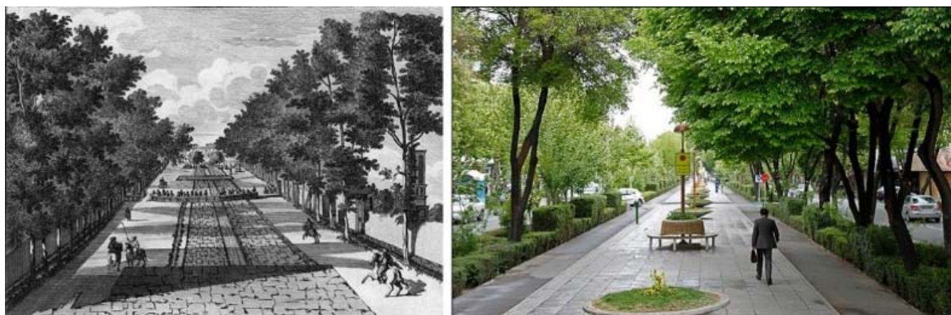
Fig. 5 Chaharbagh Street past and currently conditions [29]

As mentioned before, Chaharbagh Street is one of the historical and important streets in Isfahan. Isfahan is located in the Zagros foothills. The climate of the city is long hot-dry summer and cold-dry in winter. Chaharbagh Street, whose names come from Four Garden, has been designed based on Persian Gardens to make balance between hard climate and human thermal comfort condition. The street continues by a mild slope toward the Zayandeh Rood River. In Safavid period, there was a stream at the middle of the street. Unfortunately, later the stream was blocked and lost its positive effects on the environment (Fig. 5).