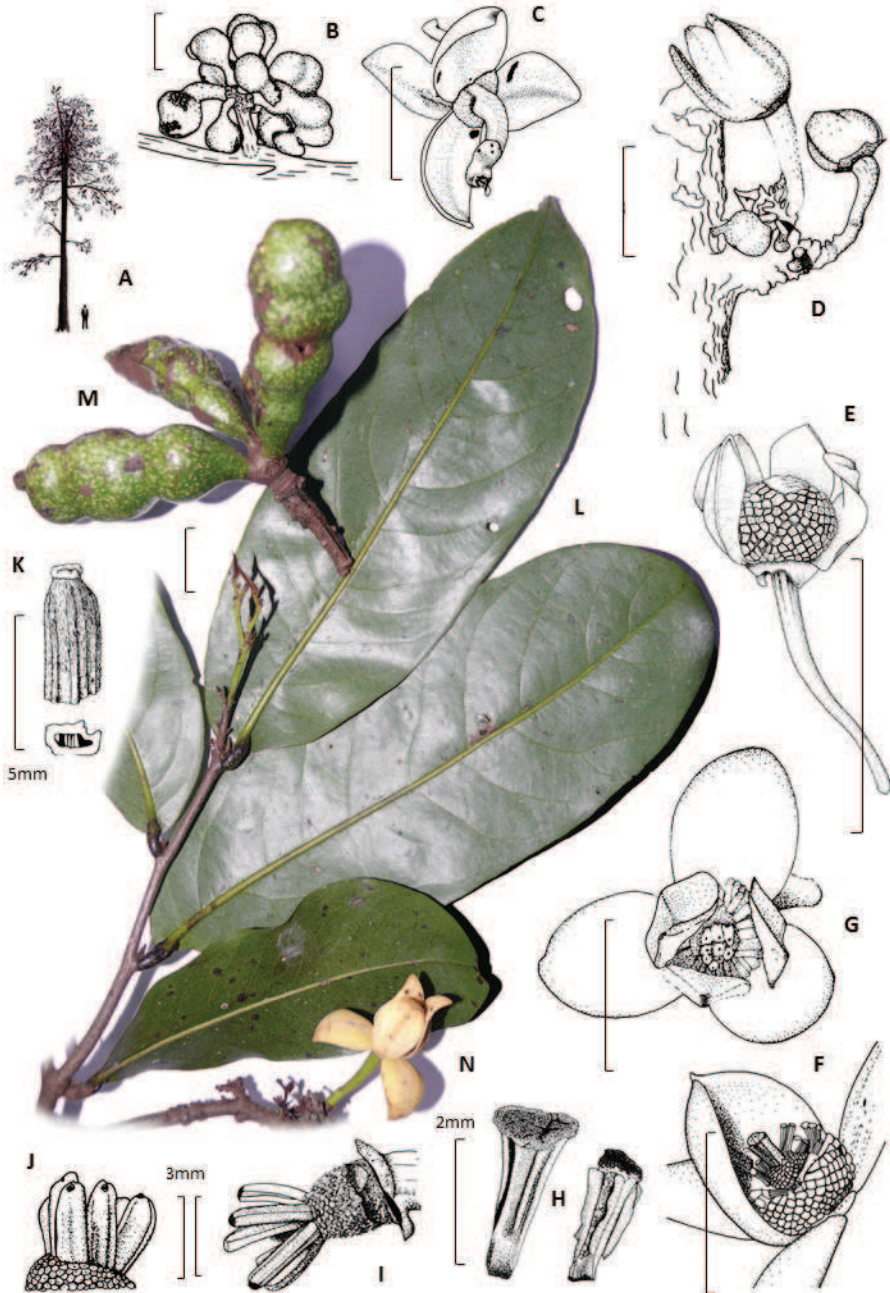
Figure 2. Polyceratocarpus askhambryan-iringae drawings of A tree architecture B fresh fruits C fresh flower below D fresh ramiflorous flower buds E–F dry and fresh bisexual flower (one petal removed) G fresh bisexual flower above H dried stamens I–J fresh and dry carpels lacking stigmas K dried carpel with stigma, plus photographs of L fresh leaves M fruit and N flower. Drawings by Sue Sparrow, A by Andrew Marshall, E and K by Andrew Brown, from the following specimens: Marshall 2070 ( B ); Marshall 2117 ( C–E and G–L ) and Luke 11279 ( F ). Scale bars: 20 mm unless stated.