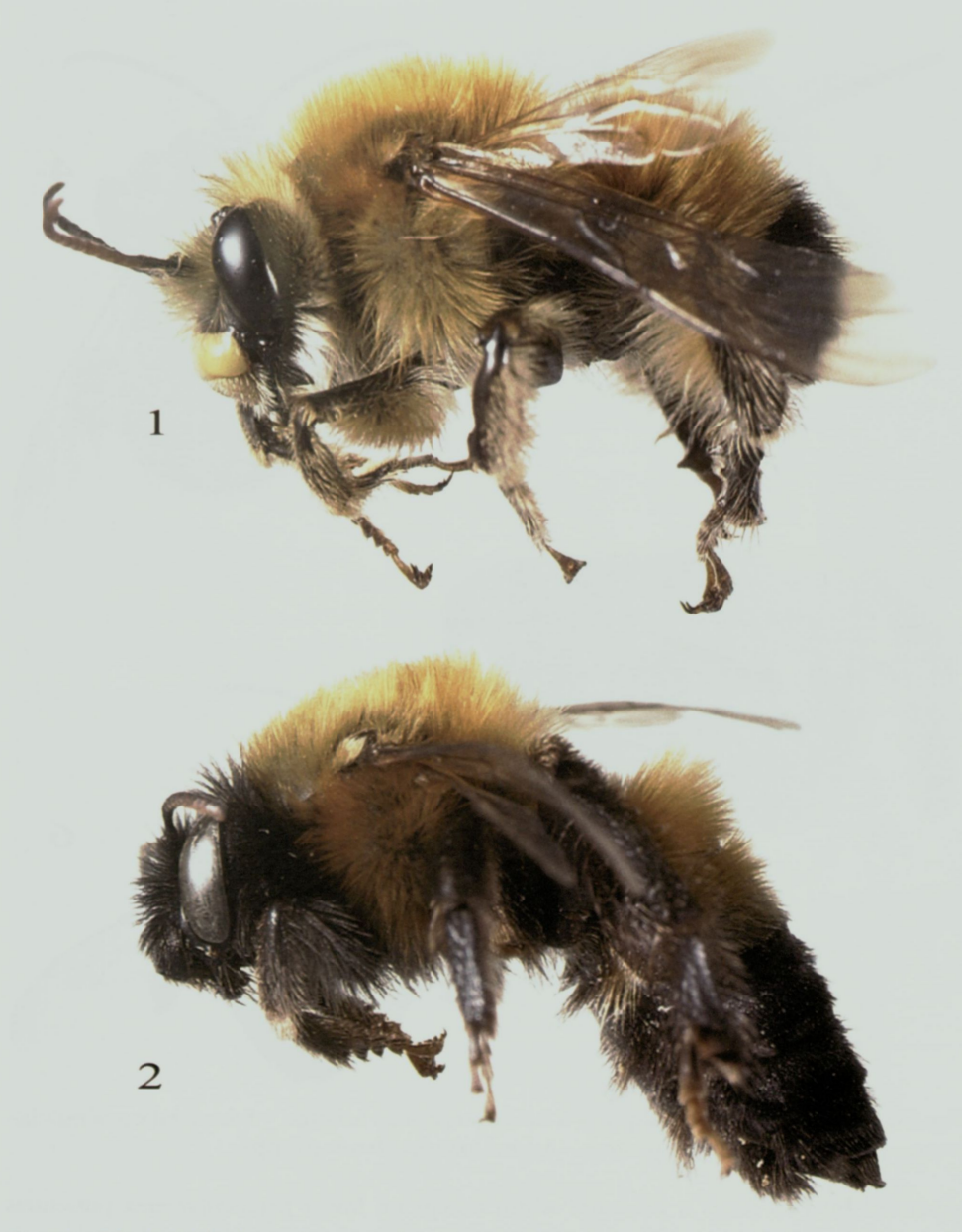
Figs 1-2: Cubitalia (Cubitalia) baal sp. n. -1 lateral habitus of male holotype. -2 lateral habitus of female paratype.

Integument of clypeus and labrum smooth; labrum with coarse punctures separated by a puncture width or less; clypeus with sparsely scattered, shallow, coarse punctures. Mandibular surfaces smooth. Integument of remainder of head strongly tesselate except faintly imbricate (nearly smooth) in small patches immediately anterior to and bordering median ocellus and along outer margins of lateral ocelli. Face with faint punctures