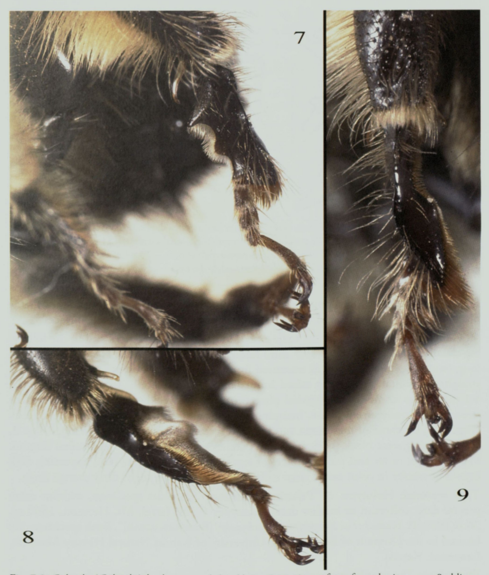
Figs 7-9: Cubitalia (Cubitalia) baal sp. n., male hind leg. – 7 anterior surface of metabasitarsus. – 8 oblique, inner-posterior surface of metabasitarsus. – 9 outer dorsal surface of metabasitarsus.

scattered, shallow, faint punctures; pleura with faint punctures separated by 1–3 times a puncture width. Metasomal terga imbricate and punctate, punctures shallow, small, and separated by 1–2 times a puncture width; metasomal sterna imbricate except smooth between lateral tufts on fifth metasomal sternum.