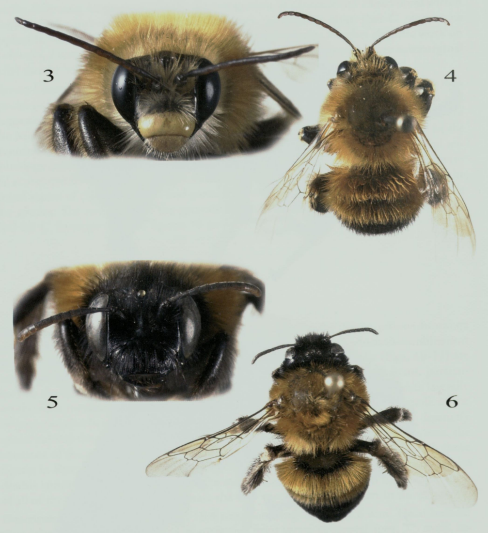
Figs 3-6: Cubitalia (Cubitalia) baal sp. n. – 3 facial aspect of male holotype. – 4 dorsal habitus of male holotype. – 5 facial aspect of female paratype. – 6 dorsal habitus of female paratype.

separated by 1–3 times a puncture width except on lower paraocular area punctures separated by a puncture width or less; punctures of vertex more distinct and contiguous; punctures on gena distinct and separated by a puncture width or less. Mesosoma strongly tesselate throughout except tegula faintly imbricate and impunctate; mesoscutum with distinct punctures separated by 2–3 times a puncture width centrally, along borders such punctures separated by 1–2 times a puncture width; mesoscutellum sculptured as on mesoscutum; metanotum strongly tesselate and impunctate (apparently slightly nodulate); propodeum strongly tesselate and impunctate on basal area, laterally with a few sparsely