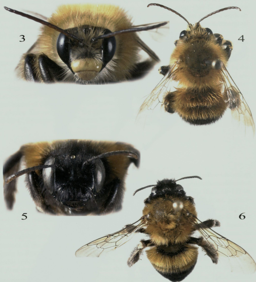
Figs 3-6: Cubitalia (Cubitalia) baal sp. n. – 3 facial aspect of male holotype. – 4 dorsal habitus of male holotype. – 5 facial aspect of female paratype. – 6 dorsal habitus of female paratype.

separated by 1–3 times a puncture width except on lower paracocular area punctures separated by a puncture width or less; punctures of vertex more distinct and contiguous; punctures on gena distinct and separated by a puncture width or less. Mesosoma strongly tessellate throughout except tegula faintly imbricate and impunctate; mesoscutum with distinct punctures separated by 2–3 times a puncture width centrally, along borders such punctures separated by 1–2 times a puncture width; mesoscutellum sculptured as on mesoscutum; metanotum strongly tessellate and impunctate (apparently slightly nodulate); propodeum strongly tessellate and impunctate on basal area, laterally with a few sparsely