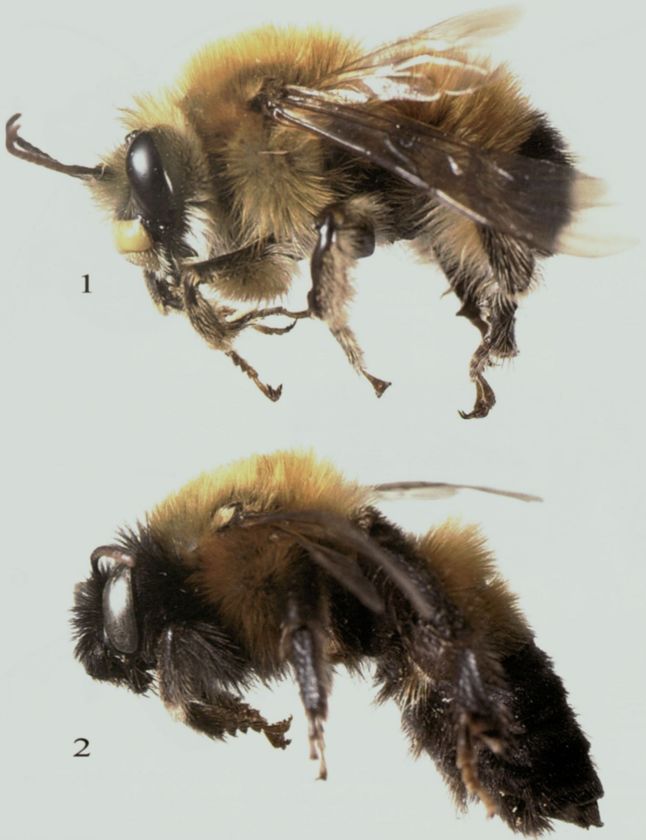
Figs 1-2: Cubitalia (Cubitalia) baal sp. n. – 1 lateral habitus of male holotype. – 2 lateral habitus of female paratype.

Integument of clypeus and labrum smooth; labrum with coarse punctures separated by a puncture width or less; clypeus with sparsely scattered, shallow, coarse punctures. Mandibular surfaces smooth. Integument of remainder of head strongly tessellate except faintly imbricate (nearly smooth) in small patches immediately anterior to and bordering median ocellus and along outer margins of lateral ocelli. Face with faint punctures