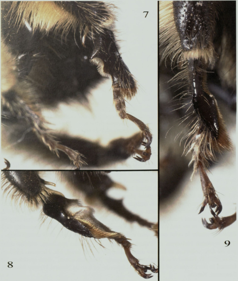
Figs 7-9: Cubitalia (Cubitalia) baal sp. n., male hind leg. – 7 anterior surface of metabasitarsus. – 8 oblique, inner-posterior surface of metabasitarsus. – 9 outer dorsal surface of metabasitarsus.

scattered, shallow, faint punctures; pleura with faint punctures separated by 1–3 times a puncture width. Metasomal terga imbricate and punctate, punctures shallow, small, and separated by 1–2 times a puncture width; metasomal sterna imbricate except smooth between lateral tufts on fifth metasomal sternum.