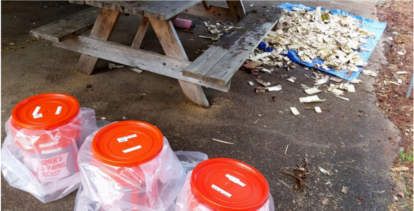
Figure 2. Banana stalks and feed silos