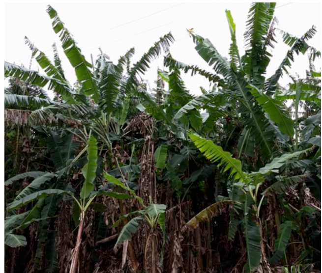
Figure 1. Banana plants in Hawai'i

In Hawai'i, the fruit and vegetable industry generate enormous amounts of by-products from agri-based products like macadamia nuts, sweet corn, bananas, and sweet potatoes. Corn stalks, or stover; banana stalks; sweet potatoes; pumpkins; and other fruits have been used in other parts of the world to make livestock feed for decades, since cereal importation is cost prohibitive. The by-products from these crops may only be available for short periods and in specific seasons of the year but are available in relatively large volumes at those times. Under normal situations, large quantities of fruits and vegetables may be wasted during the growing season due