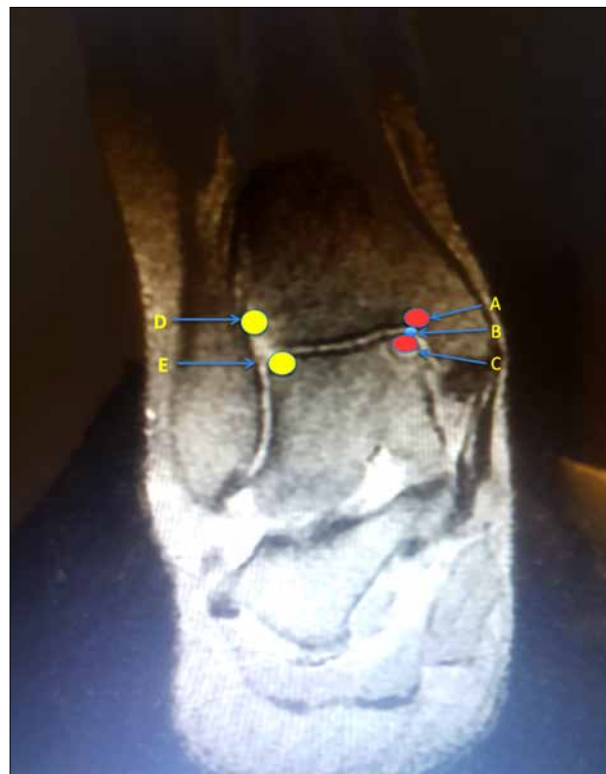
Figure 2. The injection points. A) Medial joint surface of tibia. B) Intraarticular injection point. C) Medial joint surface of talus. D) Lateral joint surface of tibia. E) Lateral joint surface of talus. Injection point A, B, and C used for posteromedial lesions; Injection points B, D, and E used for anterolateral lesions.

We used 4 mL of PrT solution without any activating agent for PrT intervention (2 mL 25% dextrose for intra-articular, 1.8 mL 15% dextrose in combination with 0.2 mL lidocaine for tibial edge and talar dome adjacent the joint surface). We used the